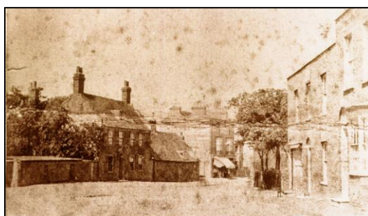
Laburnum House c. 1880