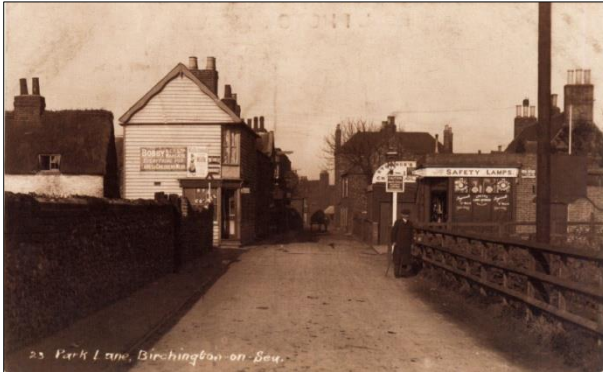
Park Lane in 1910