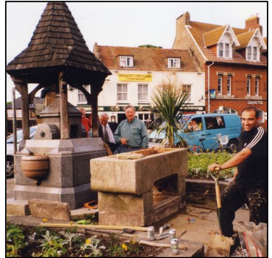
Restoration in 2000-2001