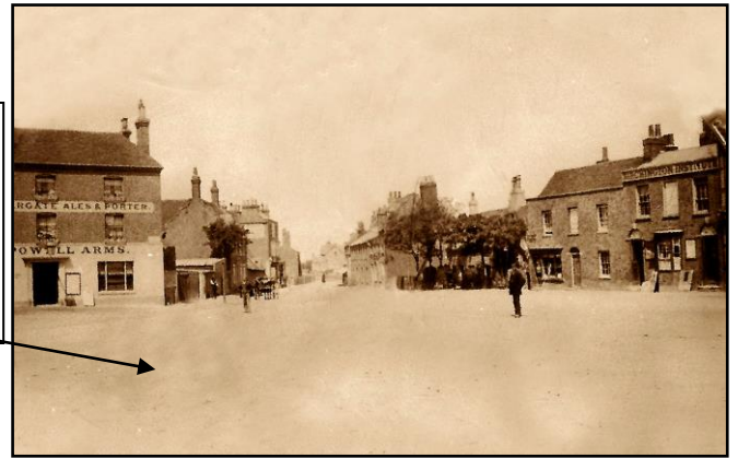
The Square - 1880