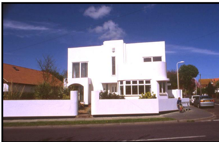
102 Minnis Road in 1999

Scans of plans dated 1902 (Fairweather – a small piece of land) “ 1939 ” 1959