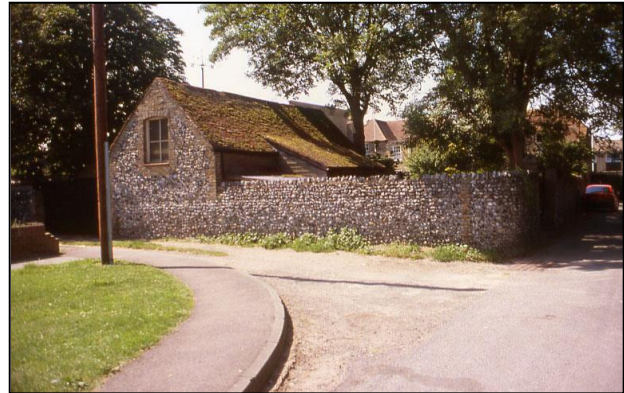
The Crispe Charity School Barn used by 1840