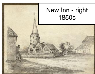
New Inn - right 1850s